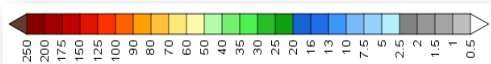
Figure: 2. Precipitation forecast for 20 March to 28 March 2018.