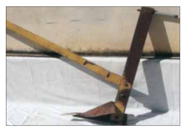
VL Syahi Hal

Hill farmers generally use the locally available traditional wooden plough. VL Syahi hal was developed as an alternative to the traditional plough. This plough can be used for ploughing as well as levelling fields. The weight was also kept within 11–14 kg to make it convenient for handling.