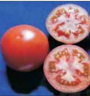
Manileima tomato hybrid found suitable under frost condition ( left ); and Kashi Hemant performed better under low light condition ( right )

from Manipur were evaluated under three growing conditions, viz. natural field (exposure to frost), low-cost polyhouse (exposure to heat) and 50% agro shade net (exposure to low light intensity). Tomato variety Manileima was found suitable under frost condition, whereas Selection 9A has shown resistance to drought and high temperature. Under low light condition, Kashi Hemant performed better than other genotypes.