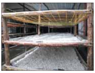
A view of sericulture unit through a cluster approach

equipment for scientific rearing. All the members of the Sangha started rearing Bivoltine hybrids after affecting modifications to the mulberry gardens and silkworm rearing houses. Appropriate production, grading, packing and marketing technologies were adopted and 34 crops were harvested in the cluster villages by 22 farmers (12 farmers completed two crops) with an average cocoon yield of 64.4 kg/100 Disease Free Laying (DFL) and the total cocoon production in 10 months time is about 25,000 kg. With an average price of `230/kg, an approximate return was `57.50 lakh. The Bivoltine cocoon productivity was 20 per cent more than the productivity of the taluk for the corresponding period.