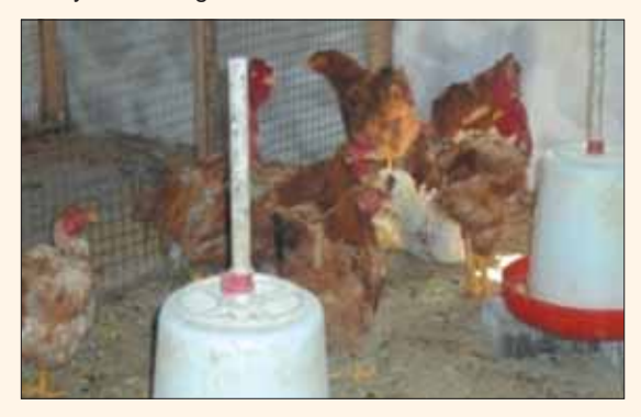
Vanaraja birds for backyard poultry

After identifying this problem, KVK Pulwama took the lead by demonstrating production potential of Vanaraja birds to the farmers. Initially, 900 Vanaraja birds were provided in the year 2011-12 to the farmers for encouraging rearing of ideal poultry strain by following good production practices in their backyard units. These backyard units acted as demonstration sites for other farmers of the district which helped in popularizing the Vanaraja as backyard poultry. The farmers who raised Vanaraja in their backyard, got the average weight of 2 kg/bird within six months as against 1 kg body weight of local bird. Thus, there was 100 % productivity enhancement. The initiative has succeeded in wide scale adoption of Vanaraja strain of poultry for backyard rearing in the district.