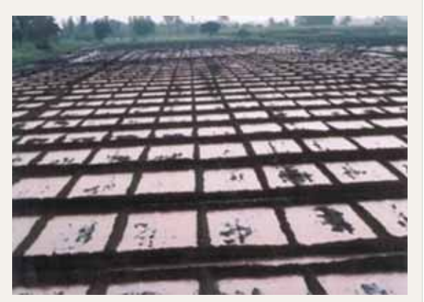
Moisture conservation in flat beds after first rain

The efforts of KVK Baramati, Pune through village wise farmers' campaign for popularizing in-situ moisture conservation technology is showing the results. Total of 42 rainfed villages were selected for this activity and demonstrations were conducted for farmers by involving farmers' clubs and State Department of Agriculture. As a result, about 256 ha was brought under this technique. With just 60 to 70 mm rainfall before sowing of rabi Jowar, farmers could harvest good yields in Baramati, Purandhar and Indapur tehsils of the district. The technique has resulted in 60 to 70 % yield increase. Where this technology was not adopted, farmers could not harvest even dry fodder (Kadbi). As a result of excellent sucess of this practice, more farmers are coming forward to adopt in-situ water conservation in forthcoming rabi seasons.