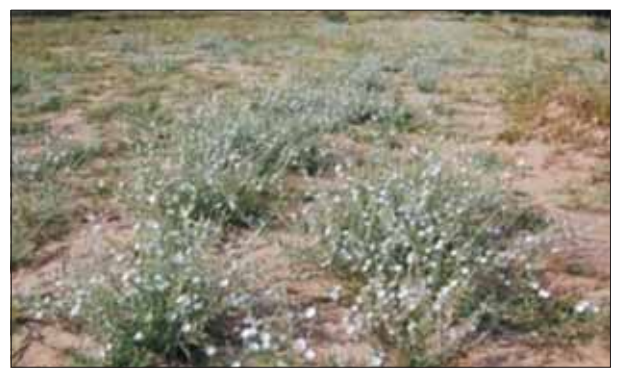
Shankhpushpi plants in field

A private company initially gave a purchase order of 70 q dried leaves of Sankhpushpi ( Convolvulus pluricaulis ). After checking the produce they got satisfied and gave another order of 300 q. The offered rate of Sankhpushpi was `19 per kg of leaves, and `1,600 per kg of seed as against `9 per kg given by local middlemen. These two successful supply of consignments made KVK trustworthy to farmers of