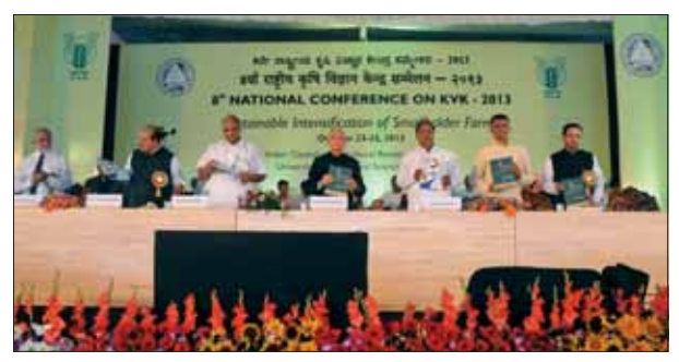
Dignitaries releasing publications during 8th National Conference on KVK

The 8th National Conference on KVK was organized at UAS, Bengaluru during 23-25 October, 2013 with focus on "Sustainable Intensification of Smallholder Farms". About 1,300 delegates took part in the deliberations including Programme Coordinators of 634 KVKs. There were eight technical sessions dealing with various sub-themes including i) Technological intensification for higher yields and improved nutrition; ii) Resilience to pests, diseases and climate for sustainable productivity of small farms; iii) Ecological intensification for sustainable cropping/farming systems, conservation agriculture; iv) Farmers rights and bio diversification of small farms; Farmer centric approaches, small agri-business models and development of social and human capital; vi) Innovative experiences of KVKs and farmers in sustainable intensification of small farms; vii) Integration of