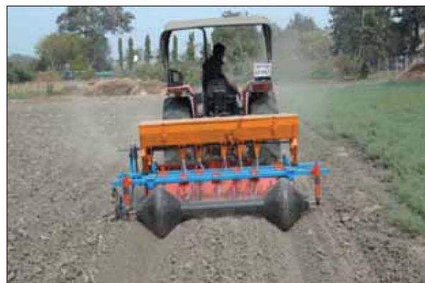
Rotary assisted raised bed former-cum-seeder

Rotary assisted raised bed former-cum-seeder: In view of the climate worthiness of the bed seeding system, a rotary assisted raised bed former-cum-seeder was developed. This unit is suitable for sowing soybean and wheat crops on raised beds. The provision for attaching a rotary tiller in front of the bed former-cum-seeder has been made. The rotary tiller can be detached while reshaping and sowing on permanent beds. The developed machine provides sufficient bed height with more intact and smooth bed compared with the sliding type bed shaper. Rolling type bed shaper also works as drive wheel for seed and fertilizer metering mechanism, which is a special feature of the machine. The width and height of bed formed by the machine is 1,200 and 200 mm, respectively. The field