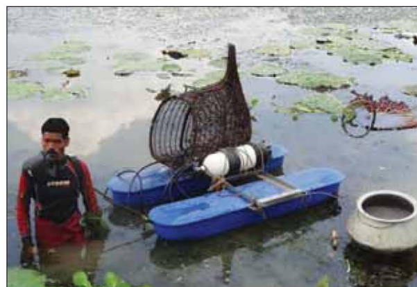
Personal protective equipment for makhana harvesting in ponds

Makhana harvesting in ponds: The manual harvesting of Makhana involves lot of drudgery. During collection of makhana seeds from the ponds, mud enters into the worker's ears, eyes, nose and mouth. The worker also gets affected from skin diseases due to this problem. To alleviate the drudgery involved in harvesting of makhana seeds from ponds, a protocol