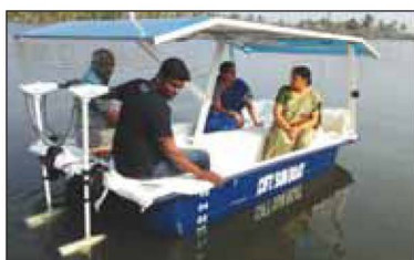
Sunboat — solar powered boat

Sunboat-the solar boat: A solar powered boat, sunboat, was developed. The boat can achieve a speed of about 4 knots/h in calm waters and can run for about two to three hours on complete charging. Its twin hull construction gives high stability during fishing activities and the deck area is wider compared with conventional boats of similar size. Propellers are made of plastic composite and do not corrode. Height of propellers is adjustable