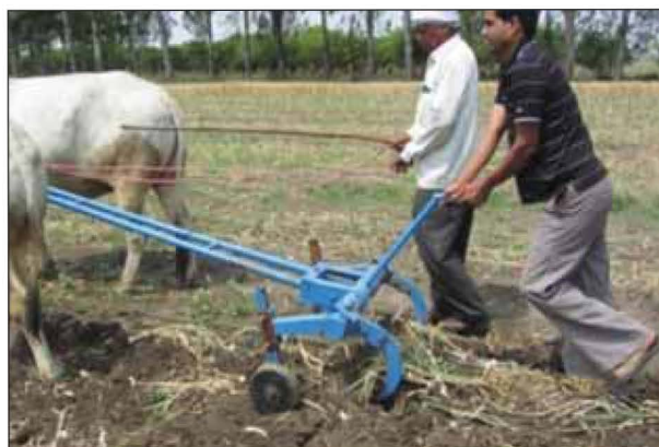
Animal drawn garlic digger

Garlic digger: Manual garlic digging with spades and shovels, is very cumbersome and time consuming. An animal drawn garlic digger was developed. The field capacity of the machine is 0.1 ha/h, which is almost 25 times more than manual digging. The digging