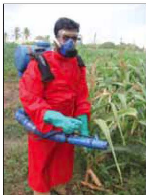
Spraying safety kit

For chlorpyrifos pesticide, the filtering efficiency of this face mask is 84.2%. The mask is comfortable to wear as the temperature rise inside the mask is only 1.6°C and the breathing resistance is a meagre 0.68 m bar. The PVC gloves identified have a good wearing as well as gripping comfort. The selected eye protector is made up of plastic frame with fibre glass ocular with good wearing and visual comfort. The lens area and the weight of the eye protector is 105 cm 2 and 70 g, respectively. An apron made using water proof polyester allows only 1.5% of pesticide penetration and 6% rise in temperature during spraying trials.