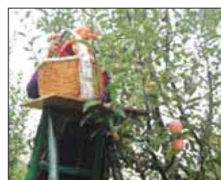
Improved ladder for apple harvesting in Himachal Pradesh

Improved ladder for apple harvesting: A light weight ladder made from locally available bamboos and weighing 12.5 kg was fabricated for apple harvesting. The ladder allows climbing up to a height of 2.40 m. This bamboo ladder helps the women workers to carry out the plucking of fruits comfortably and one worker can harvest about 100 kg of apples per hour. It can also be used for plucking other fruits like apricot, walnut, pomegranate and for other household chores also.