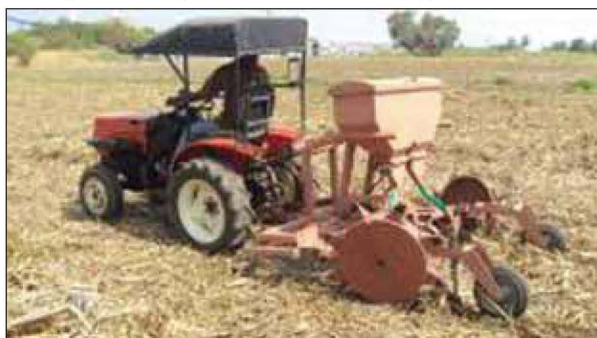
Tractor operated fertilizer dibbler for ratoon sugarcane

Fertilizer dibbler for ratoon sugarcane: The field, after harvest of sugarcane, is covered by a mat of trash to a depth of 150 mm. Application of fertilizer through the crop residue requires dibbling by punching through the crop residues. A tractor operated fertilizer