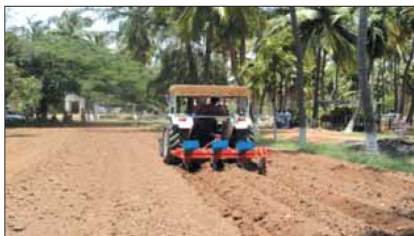
Turmeric rhizome planter

Turmeric rhizome planter: A tractor rear mounted turmeric rhizome ridger planter was developed. The planting mechanism includes rhizome hopper, cup feed seed metering mechanism, rhizome metering shaft, shoe type furrow opener and spike tooth ground wheel with