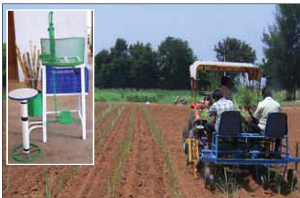
Sugarcane bud chipping equipment

Sugarcane bud chipping equipment: The number of buds required to plant per hectare is 24,700 (at a spacing of 90 cm × 45 cm). Conventionally the chipping is done manually making it cumbersome and it takes about 205 h to chip buds required for 1 ha. Three models of sugarcane bud chipping equipments such as: pedal operated unit, pneumatically operated unit and a motorized unit have been developed. These units extract 700, 1,100 and 2,500 bud chips/h, respectively, saving in the cost of ₹ 26, 50 and 90, respectively.