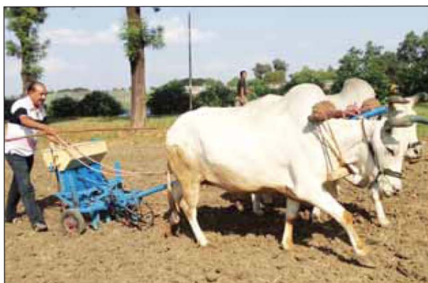
Animal drawn three-row garlic planter-cum-fertilizer applicator

0.08 ha/h, respectively. The height of hopper can be adjusted with the help of lifting rod handle to regulate quantity of cloves in metering section. Seed spacing, miss index and multiple index were 10.87 \pm 4.01 cm, 10.23 and 7.45, respectively, in field conditions. The seed damages were as low as 4% and the labour requirement is only 13 man-h/ha.