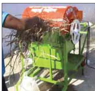
Axial flow multi-crop thresher for hilly region

For cowpea, the best threshing performance was obtained at 15 mm concave clearance and 370 cylinder rpm (7.16 m/s) with a threshing efficiency of 98.9%, cleaning efficiency of 99.2%, visible grain damage of 2.2% and total losses of 2.8%. For wheat, the best performance was obtained at 15 mm concave clearance and 570 cylinder rpm (11.04 m/s) having threshing efficiency of 99.4%, cleaning efficiency of 99.1%, visible grain damage of 2.5% and a total loss of 2.4%.