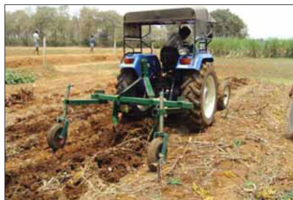
Tractor operated cassava harvester

Cassava harvester: Harvesting of cassava is done manually by loosening the soil with crowbar, if the soil is compact. The plant is pulled up gently without dragging the roots. This process is tedious and requires about 40 man days/ha. A tractor operated cassava harvester works well with two rows in sandy soil and with single row in heavy soil. The field capacity is 0.08 ha/h for single row and 0.17 ha/h for two rows. The undug tuber is 2.5% and damage to tubers was less than 1%. It saves 40% cost compared with manual harvesting.