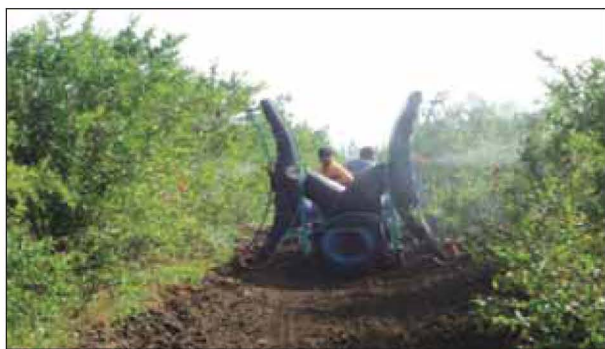
Pomegranate spraying system based on ultrasonic sensors

Pomegranate spraying system based on ultrasonic sensors: A universal tractor mounted ultrasonic sensor based pomegranate spraying system has been designed and developed. To make the pomegranate sprayer independent of operating speed, a ground wheel with proximity sensor was attached to the spraying unit. The effective field capacity and number of plants covered are 0.88 ha/h and 1,370 plants/h, respectively. The maximum application rate was 500 l/ha for turbo nozzles without sensor and the minimum rate was 200 l/ha for hollow cone nozzle with sensor. The maximum discharge rate was 440 l/h for turbo nozzles without sensor. The minimum discharge rate was 175 l/h for hollow cone nozzle with sensor. The percentage saving of liquid ranges from 25 to 30% and 45 to 50% with turbo nozzles and hollow cone nozzles, respectively.