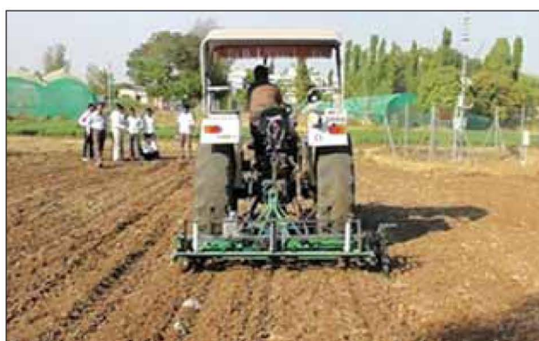
Tractor operated pneumatic planter for okra and cotton

Pneumatic planter for okra and cotton: A tractor operated pneumatic planter suitable for planting okra and cotton seeds was developed. The effective field capacity of the machine is 0.29 ha/h at 85% field efficiency for planting okra. The operating cost is low