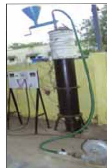
Entrained gasifier for different crop residues

Generation of bio-char from crop residues: A horizontal axis bio-reactor was developed and evaluated to generate char from the crop residues. Slow pyrolysis was conducted in the electrically heated horizontal reactor to generate char from the pigeon-pea stalk. The char recovery varies from 33 to 60% depending on pyrolysis conditions. The total carbon in the raw material is 45 \pm 0.5\% which could be increased to 78% by charring. The pH of the char was shifted towards basic nature ( \text{pH} > 7 ) from the acidic nature of the raw material. The char generated from the unconfined system had a superior activation energy profile in comparison to that from confined system. The char generated under unconfined chambers could be adopted as bio-char for improving the soil quality.