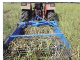
Tractor operated garlic harvester

Garlic harvester: Garlic harvesting, a very time consuming operation, requires labour of 30 man-days/ha. A tractor operated garlic harvester cum windrower was developed to harvest garlic. The power is given by tractor power take off (PTO) to gearbox with a ratio of 1 : 1. The field capacity of the harvester is 0.26 ha/h at a forward speed of 2.4 km/h.