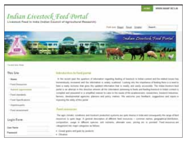
Indian livestock feed portal is being developed to include the information on feed resources, nutrient requirements, feed standards, feed markets, imports and exports and feed assessment

Feed database: A structured methodology and software platform was developed to launch the refined livestock feed resources database with national acceptability for cattle and buffaloes. The livestock population and the feed balance (2009-10) were estimated for various states. Indian livestock feed portal is being developed to include the information on feed resources, nutrient requirements, feed standards, feed markets, imports and exports and feed assessment. A matrix of 712 feed resources with composition, mineral topography, rumen degradable and un-degradable protein contents and amino acid profile, was developed.