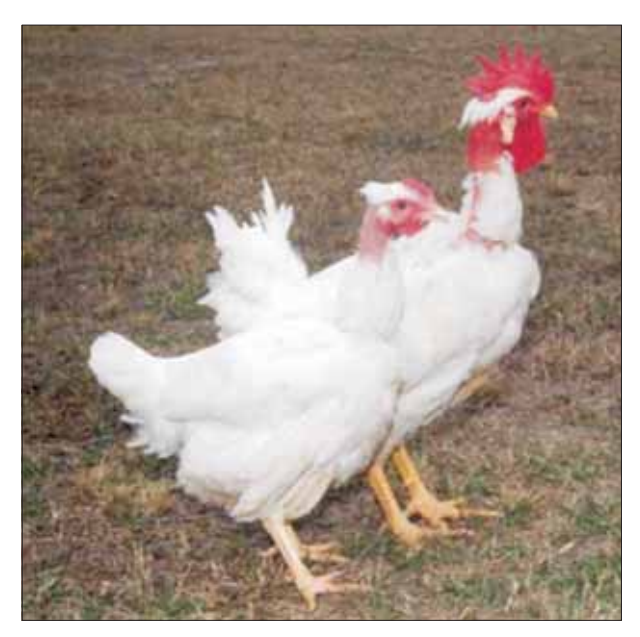
CARIBRO-Mritunjai (Naked neck) exhibited better tolerance to tropical stress

Tolerance to tropical stress: Naked neck broiler CARIBRO- Mritunjai exhibited better tolerance to tropical stress than CARIBRO-Vishal (normal plumaged), and CARIBRO-Tropicana (naked neck and frizzle plumaged).