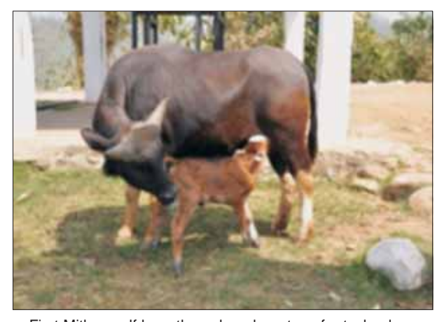
First Mithun calf born through embryo transfer technology with mother

Birth of first ever mithun calf using ETT: Superovulation in mithun cows was carried out after synchronizing estrus using CIDR and PGF_2\alpha . All the mithun cows were inseminated with cryopreserved mithun semen. Flushing was carried out on day 6 of following estrous cycle followed by searching and evaluation of embryos. Five embryos were recovered and transferred to synchronized recipient mithun cows. Out of the four embryos transferred to the recipient cows, one cow delivered a male calf, the first ever mithun calf produced using ETT.