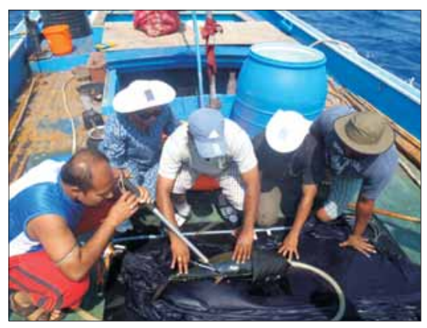
Tuna with pop up satellite tag

Managing fishery resources through pop-up satellite tags (PSAT): India joins the elite group of countries engaged in satellite tracking of yellowfin tuna (Thunnus albacares) a migratory fish. Movements of yellowfin tuna in oceanic waters near and away from Indian waters remain untested and exchange rates are still unidentified. Tagging was done to study growth and migration of marine fishes. Tuna, mainly the bluefin tunas, are tracked using tags in the Atlantic Mediterranean and Australian waters but not in Indian waters. To know about the telemetry studies on migration patterns of tunas in Indian sea, the tagging programme funded by INCOIS under the project entitled "Satellite Telemetry studies on migration patterns of tunas in Indian sea" (SATTUNA) was taken up by the CMFRI. The tags are attached externally and have a release mechanism that causes the tag to detach from the fish at a predetermined time and "pop-up" to the sea surface where the data can be recovered via the ARGOS system aboard polar-orbiting NOAA satellites, therefore provide fisheries-independent