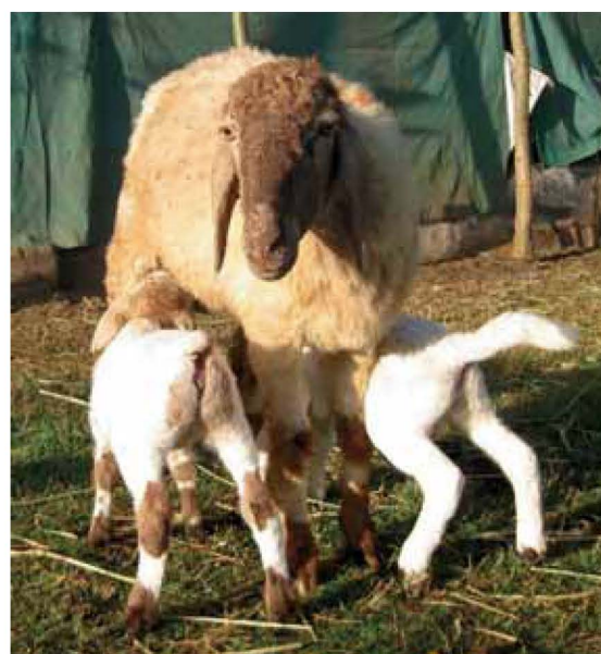
Prolific sheep (GMM × P) was developed and its evaluation under organised feeding and management is continuing