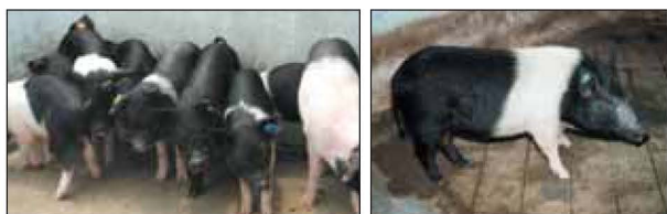
Pig varieties developed at NRC on Pig: variety I ( H_{50}G_{50} ) Variety II ( H_{50}M_{50} )

Suitable pig varieties for farmers' field: The breeding programme includes parental lines of exotic Hampshire and Duroc (male), and indigenous Ghungroo and Niang Megha (female) pigs. Animals of Hampshire-Ghungroo crosses showed better performance with respect to production, reproduction, adaptive and carcass traits than Hampshire-Niang Megha crosses at organized farm as well as farmers' field. Age at first heat and age at first service were 270.52 \pm 6.85 and 311.51 \pm 7.96 days, respectively. Pre-and post-weaning growth rates were 122.45 \pm 6.31 and 240.87 \pm 20.35 g/day. Slaughter weight at 8 months age was 57.49 \pm 1.62 kg.