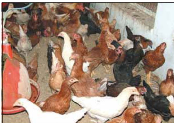
Pullets of three way cross (PD1 x IWI x PD3)

Improvement of poultry for eggs: The layer lines IWN and IWP at KVASU, Mannuthy and AAU, Anand, and IWD and IWF strains at SVVU, Hyderabad, were improved through intra-population selection under the AICRP on Poultry Breeding. At KVASU, Mannuthy, hen housed and hen day egg production up to 64 weeks of age increased by 13.4 and 11.4 eggs, respectively, over previous generation in IWN strain. In IWP, hen housed egg production up to 64 weeks of age increased by 1.0 egg over previous generation. At AAU, Anand, egg production up to 64 weeks of age increased by 9.64 eggs in IWN, by 11.05 eggs in IWP and by 21.52