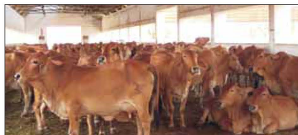
Progeny testing programme on Sahiwal is being carried out as associated herd programme involving organized Sahiwal herds at different locations

Sahiwal: Progeny testing programme on Sahiwal is being carried out at NDRI Karnal (Germplasm unit);