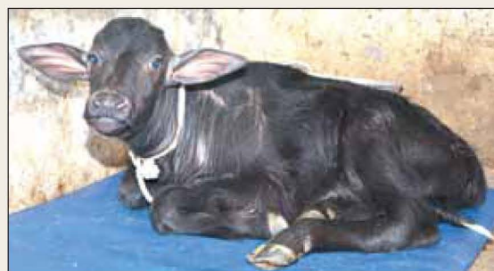
Cloned calf named 'Lalima', produced through 'Hand-guided Cloning' on 2 May 2014

Female cloned buffalo calf named 'Lalima', produced through 'Hand-guided Cloning', born on 2 May 2014, weighed 36 kg at birth, at NDRI Livestock Farm. The donor cell was taken from the ear of MU-5345, an elite Murrah buffalo, which produced 2,713 kg milk in standard lactation period of 305 days, and 3,494 kg in total lactation period of 471 days during her third lactation.