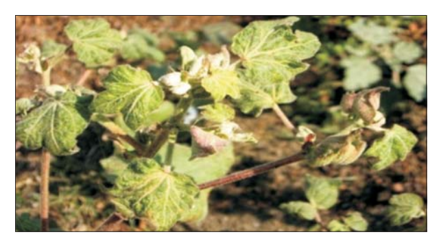
Infected plant showing symptom of CLRDV

primer. The presence of virus was tested from infected samples. The cDNA thus obtained was sent for sequencing, and sequenced product was matched using NCBI blast; and it was observed that the virus belong to Luteovirideae family.