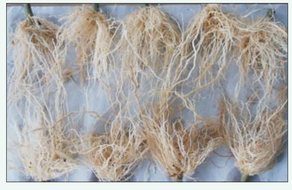
Root system of plant grown in metham sodium-treated soil at 30 ml/m<sup>2</sup>

Metham sodium has been found promising for management of this nematode. This chemical was evaluated as soil sterilant (at 30 ml/m<sup>2</sup>) alone before transplantation of seedlings and was also evaluated in combination with neem-cake at 200 g/m<sup>2</sup>, enriched with either Paecilomyces lilacinus at 50 g/m<sup>2</sup> (cfu 2 \times 10^6 ) or Pseudomonas flurescens at 50 g/m<sup>2</sup> (cfu 2 \times 10^9 ) mixed 15 days prior to sowing.