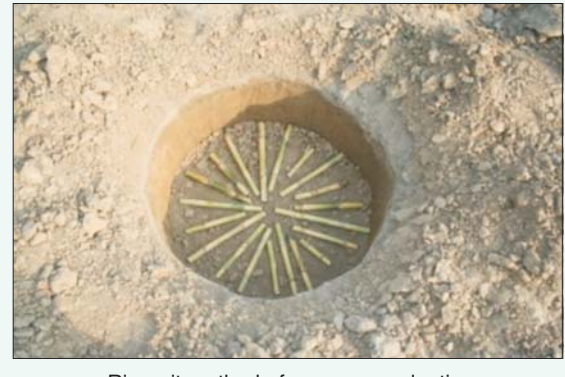
Ring-pit method of sugarcane planting

Use of water-saving sugarcane technologiesskip-furrow method of irrigation, ring-pit planting method, irrigation at critical growth stages and trash mulching-at the fields of cane-growers in the participatory mode in the Central Uttar Pradesh in sugar mill zones of Biswan, Sitapur, Rauzagaon and Haidergarh and Barabanki was demonstrated. The maximum increase in cane yield was recorded in ringpit method of planting (109.70%) over conventional method, followed by skip-furrow method of irrigation (49.12%), irrigation at critical growth stages (18.44%) and trash mulching (17.63%). Increase in irrigation water-use efficiency (IWUE) was recorded highest in ring-pit method of planting (151.61%) over the conventional method, followed by skip-furrow method of irrigation (149.78%), irrigation at critical growth stages (90.58%) and trash mulching (41.17%).