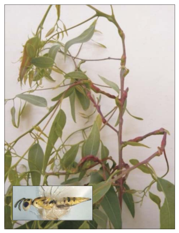
Eucalyptus galled shoot (inset : Quadrastichus mendeli)

Eucalyptus gall wasp, Leptocybe invasa (Eulophidae: Hymenoptera) was accidentally introduced into India, and has become a serious pest on eucalyptus, threatening Indian paper industry. Parasitoids, Quadrastichus mendeli and Selitrichodes kryceri (Eulophidae: Hymenoptera) were imported from Israel for its biocontrol. Q. mendeli could be established in all released areas of eucalyptus plantations in Karnataka, Andhra Pradesh, Odisha, Gujarat, Haryana and Punjab.