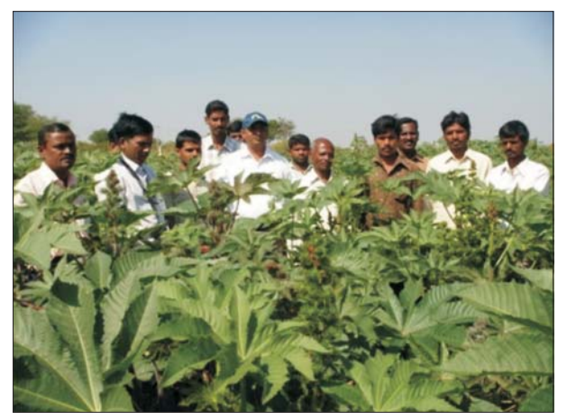
DCH 177 castor-seed production training to farmers

Castor-seed production by Andhra farmers: Seed programme of two castor hybrids DCH 177 and DCH 519 was organized in farmers' fields at 3 villages, Cherkur, Peddapur and Veldanda of Mahabubnagar district (Andhra Pradesh) in participatory mode. The farmers were trained on cultural practices along with the seed-crop management. Hybrid seeds of 8.1 tonnes of DCH 177 and 35 tonnes of DCH 519 were procured from farmers. The farmers also sold bulk seeds of male-parent of these hybrids. Farmers were able to get on an average of ₹ 45,000/ha as profit by growing hybrid seed-crop for 6–7 months.