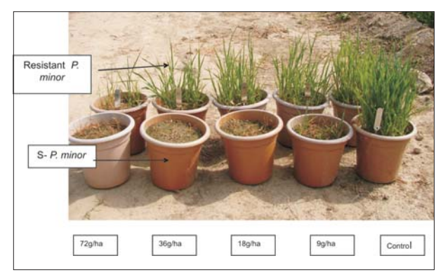
Weed management in wheat

Weed management in wheat: Both grassy and broad-leaved weeds infest wheat-crop. A ready-mix combination of Sulfosulfuron + Carfentrazone 45 (25+20) WDG was found effective in controlling complex weed flora in wheat. For its better efficacy surfactant is required; a dose of 625 ml/ha with surfactant is sufficient of the mixture as compared to 1,250 ml/ha. Where this combination is used in wheat; succeeding crop of sorghum and maize should not be grown. A new herbicide Pyroxsulam also found promising in controlling most of the grassy and broadleaved weeds, viz. Phalaris minor, Avena ludoviciana, Malva parviflora, Lathyrus aphaca and Medicago denticulata. As far as herbicide resistance in P. minor is concerned, Pyroxsulam effectively controls susceptible as well as its populations that are resistant to Clodinafop and/or Isoproturon but it could not control Sulfosulfuron-resistant populations.