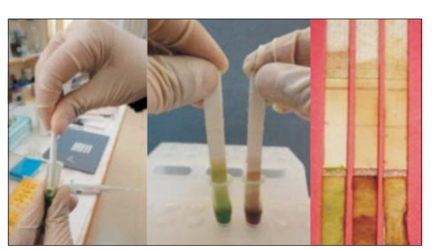
Dipstick for detection of potato viruses

Soil solarization together with incorporation of stable bleaching powder @ 3 q/ha was found effective for control of russet scab disease of potato. Application of Thiacloprid (0.3 and 0.4%) along with summer oil (0.06%) gave longer protection against aphids, while application of Thiacloprid alone was effective against whitefly. Monocropping of potato hybrid OS/93 D 204 in potato cyst nematode infested plots in Nilgiris resulted in the lowest PCN population, followed by the recommended practice of growing potato + Frenchbean intercropping in the autumn season.