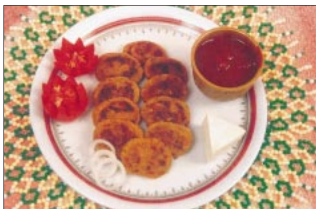
Vegetarian kabab has been prepared using soybean tofu and Bengalgram splits in different combinations