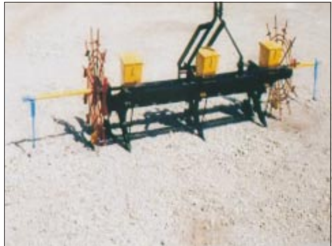
MPKV check-row planter