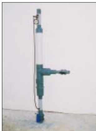
A low-cost screen filter, sufficient for micro-irrigation system in greenhouse

Mole drains are unlined cylindrical channels formed in sub-soil, which function like clay or plastic drain pipes. A tractor-drawn mole plough was designed and evaluated at CIAE, Bhopal. Mole drains were formed at a depth of 60 cm with 60 m lateral length with 75 hp tractor using mole plough in an experimental area of 0.3 ha, at three spacings (2, 4 and 6 m) and 4 replications leaving 6 m buffer strip and control plot of 0.5 ha. After installation, short lengths (1.0 m) of perforated PVC pipe of 110 mm diameter was inserted in each mole channel outlet to prevent the collapse of outlet. The mole drain outlet was then