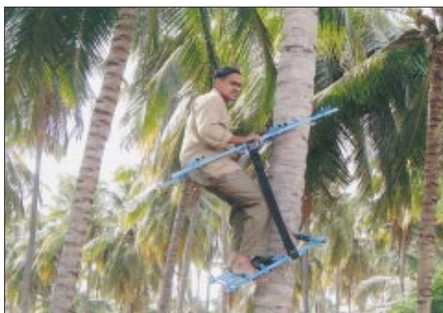
With tree climber the operator can safely climb a tree of 10 m height in 1.5 minutes

Tree climber: TNAU, Coimbatore Centre of AICRP on FIM has developed a tree climber free from any accident risk during its operation. The climber made of MS square pipe consists of two components. The components are connected by adjustable belts. The upper component is provided with a seating arrangement and lower component is having provision for holding the foot.