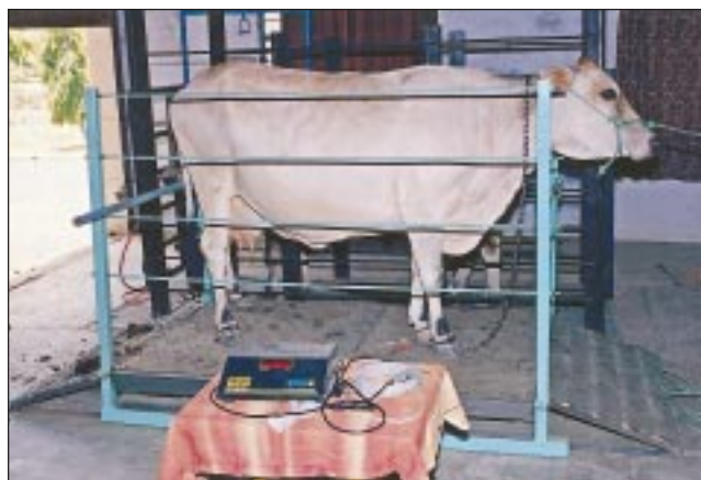
Portable electronic weighing machine for animals has the capacity of 1,500 kg (least count 1%)

Portable electronic weighing machine for animals: The portable platform type electronic weighing machine of 1,800