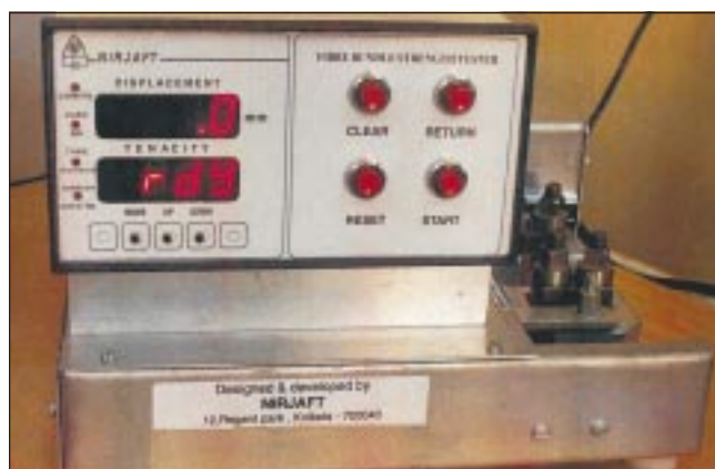
Electronic fibre bundle strength tester is a manually-operated device developed by NIRJAFT

Electronic fibre bundle strength tester: Manually-operated jute fibre bundle strength testing instrument, designed and developed by NIRJAFT has been in use for more than three decades. The instrument results in about 5% error in addition to the human errors involved in operation. The current electronic instrument is a newly developed precision instrument for automatic operation and recording of data digitally which will completely remove the human error. Moreover, as the instrument is totally portable, it can be used in fields as well. The results can be stored automatically in built-in memory of the instrument which can be downloaded in laboratory with PC interface. This instrument is