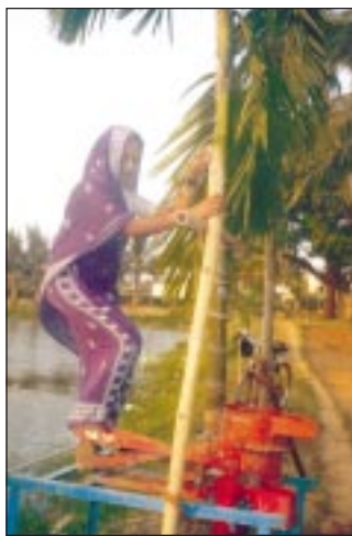
Ergonomic evaluation of irrigation pedal pump

Pedal-operated paddy thresher: The OUAT Centre of AICRP on ESA developed a double gear type pedal-operated paddy thresher. It was evaluated with 15 women workers. Mean heart rate during work was observed to be 127 beats/min and the mean change in heart rate values was 55 beats/min. The oxygen consumption rate was 0.86 l/min. The output of the thresher was 30 kg/hr. As the physiological workload is on higher side it is recommended to operate the thresher by two women workers in tandem so as to get comfort as well as output.