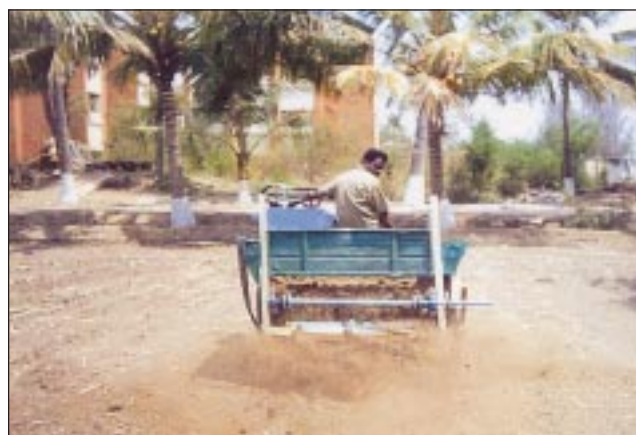
TNAU power tiller operated manure spreader. It has the field capacity of 0.62 ha/hr

Manure spreader: TNAU, Coimbatore Centre of AICRP on FIM has developed power tiller-operated manure spreader. The unit consists of main frame, manure tub, conveying mechanism, spreading mechanism and adjustable rear aperture. For controlling the quantity of manure fed to spreader, adjustable door was provided in the rear end of the manure tub. The field capacity of the manure spreader was 0.62 ha/hr. The cost of spreading