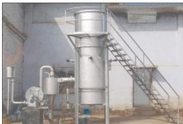
Open core biomass gasifier installed in an industry for chicory roasting

Open core down draught gasifier: For thermal applications, developed by SPRERI, Vallabh Vidyanagar Centre of the project, with a fuel burning capacity of up to 100 kg/hr has been installed in an industry in Khaira district of Gujarat to replace conventional