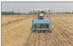
Zero till drilling