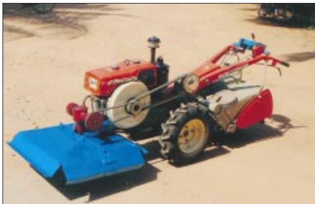
Shredder-cum-in situ incorporator developed by TNAU has the field capacity of 0.08 ha/hr

sown at 60 cm row spacing. The field capacity, weeding efficiency and plant damage varied from 0.10 to 0.13 ha/hr, 65–75% and 2–3.5%, respectively. The average cost of weeding was Rs 600/ha. The speed of power weeder varied from 2.3 to 2.5 km/hr in different trials with effective working width of 55 cm.