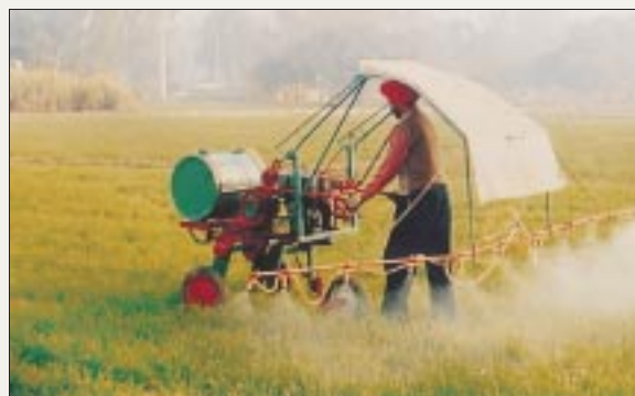
PAU self propelled walking type sprayer in operation

Crop spraying in most parts of Punjab is carried out with knapsack sprayers. Output from these sprayers is not uniform. Tractor-operated sprayers are not popular because of unsuitability of tyre width for the row spacing of 200 mm. To solve these problems, PAU, Ludhiana Centre developed light weight boom sprayer with narrow rubber wheels.