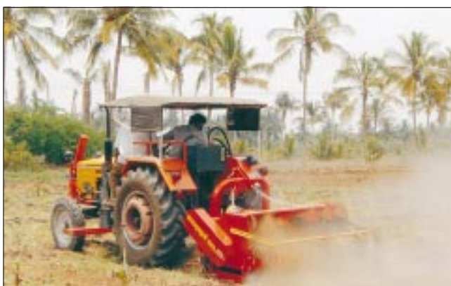
TNAU rotary field shredder for shredding sugarcane trash and crop residues

Rotary field shredder for sugarcane: TNAU, Coimbatore Center of AICRP on FIM has developed a tractor-mounted rotary field shredder for shredding the sugarcane trash and crop residues