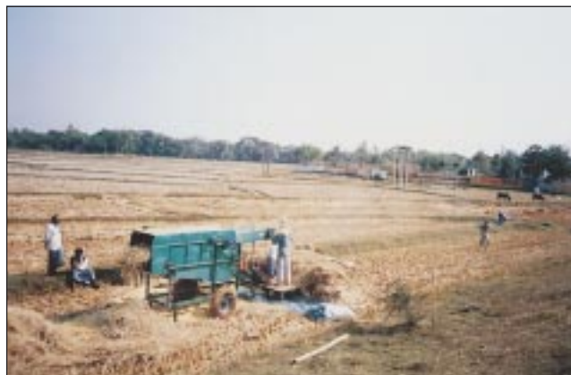
Flow through paddy thresher. The threshing efficiency and output capacity has been estimated at 99% and 1,300 kg/hr, respectively

drum speed of 955 rpm. The grain moisture (wb) was 12.59%. The threshing efficiency and output capacity were 99% and 1,300 kg/hr, respectively. The broken grain per cent varied from 0.6 to 1.1%. The cost of operation was Rs 18/q. It saved 72% in cost of operation as compared to manual threshing and time from 85 to 92% than conventional method.