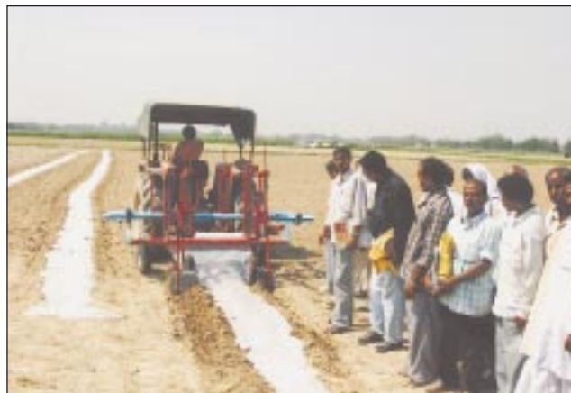
Plastic mulch laying machine. Plastic sheets from 5 to 30 micron thickness and up to 1,500 mm width can be used on the machine

The trials of machine were conducted at CIAE Farm and at IIVR, Varanasi on 0.3 ha using white colour plastic sheet of 25 micron thickness. Plastic sheets from 5 to 30 micron thickness and up to 1,500 mm width could be used on the machine. CIAE,