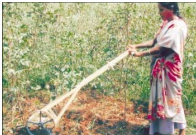
Ergonomic evaluation of cotton stalk puller