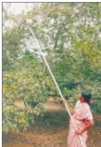
Ergonomic evaluation of fruit harvester

Sugarcane stripper: The IISR design of sugarcane stripper was evaluated with 15 men and 15 women workers at OUAT, Bhubaneswar of AICRP on ESA. The mean heart rate during work with this equipment was observed to be 119 beats/min and 116 beats/min for men and women workers, respectively. The corresponding \Delta HR values were 42 beats/min and 47 beats/min whereas the oxygen consumption rates were 0.57 l/min and 0.51 l/min. The output values per hour were 49 kg/hr for men and 46 kg/hr for women workers.