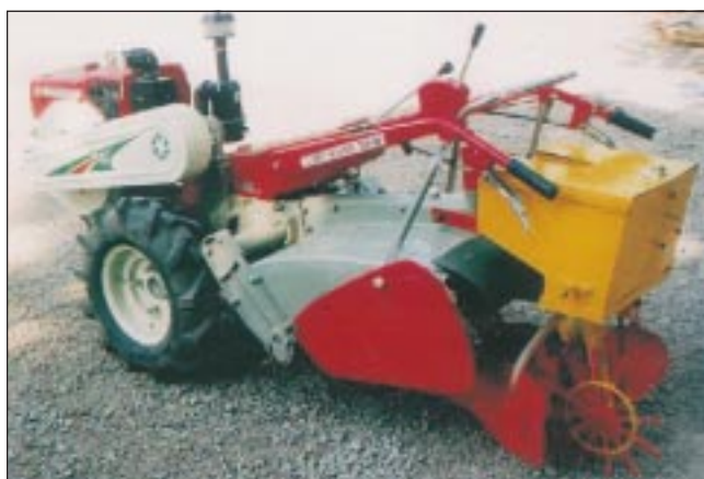
Power tiller mounted earthing-cum-fertilizer applicator for wide row sugarcane crop is developed by MPKV

Earthing-cum-fertilizer applicators A power tiller-mounted unit suitable for earthing-up-cum-fertilizer application in wide row sugarcane crop has been developed by MPKV, Rahuri Centre of AICRP on FIM. The earthing-up unit consists of single ridger