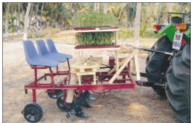
TNAU three-row plug type vegetable transplanter