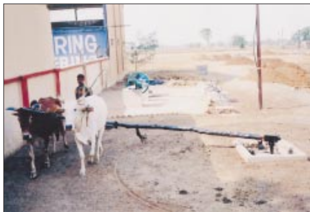
Animal rotary mode set up in operation

Animal rotary mode set up: To increase utilization of animals, the chaff cutter, winnower, castor/groundnut decorticator, dal mill, rice thresher were installed in villages and operated by