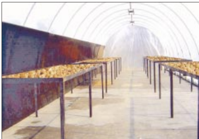
Walk-in type solar tunnel dryer installed in a farm for drying goose berry pulp

Walk-in type solar tunnel dryer: It was developed by MPUAT, Udaipur Centre and has recently been adopted for drying goose berry pulp and hand made paper sheets. A 3.75 m × 21.00 m size solar tunnel dryer has been installed on a goose berry farm