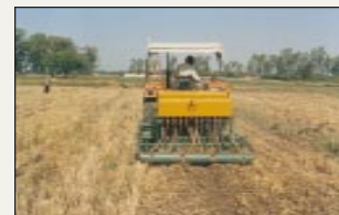
Roto till drilling

ha=4.62 and benefit : cost ratio=1.78) showed 16.9% higher grain yield with 30.8% increased benefit : cost ratio. Zero and minimum tillage-seeding of wheat were time, fuel and cost effective for 62.4-71.8, 50.7-69.1 and 49.8 - 68.3% respectively than the conventional tillage (03-passes)-seeding (time, hr/ha = 12.35, fuel used, l/hr = 39.5 and cost of operation, Rs/ha 2,174). The conservation tillage wheat was advantageous in terms of higher net income and benefit : cost ratio for 11.53-16.02 and 15.4-21.9% respectively over the conventional practice (net income, Rs/ha =17,955 and benefit : cost ratio=2.63).