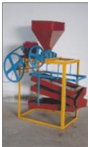
Hand-operated lac grader

Molecular characterization of lac insect lines: DNA isolation protocol has been standardized for single mature female lac insect. PCR conditions for screening of primers and RAPD studies were optimized. Preliminary screening of 20 lac insect lines using 8 random primers yielding positive amplicons showed that this technique would be useful for molecular characterization of lac insects at both intra- and inter-specific levels.