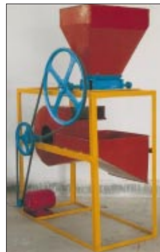
Hand-operated lac winnower for village level processing