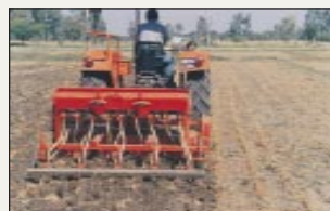
Strip till drilling