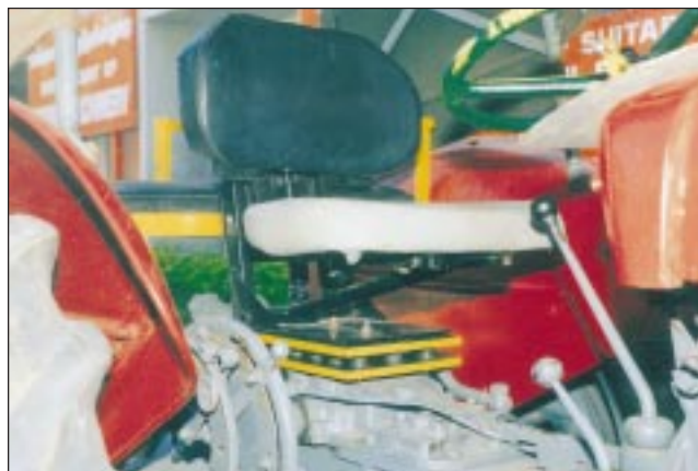
Vibration isolator attached under the seat of a tractor

PAU Centre carried out a study to know the status of adoption of safety features on chaff cutters made by 29 manufacturers in Punjab. About 69% of the manufacturers did not provide gear reversal mechanism. Cutting mechanism was found to have no safety features namely flywheel locking device, front safety guard and covers on each blade and emergency stop control as specified in BIS standards (IS: 11459-1995, specification for power-operated