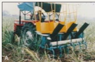
Tractor-mounted multipurpose equipment under interculture mode (a), in seed drill mode (b) and in puddling operation (c)

Tractor-mounted multipurpose equipment for sugarcane has been developed by IISR, Lucknow Centre of AICRP on FIM. There are two