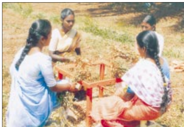
Ergonomic evaluation of groundnut stripper

Four-row paddy transplanter: The CRRRI four-row paddy transplanter was evaluated with 15 women workers. The mean heart rate during work was 138 beats/min and the \Delta HR value was 68 beats/min. The oxygen consumption rate was observed to be 1.0 l/min. Output per hour with the four row unit was 0.017 ha/hr.