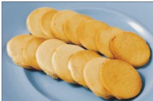
Soy-finger millet based biscuits. The process and recipe have been standardized and is ready for commercial application

recipe of soy-fortified biscuits. As level of finger millet flour incorporation increased, protein content of the biscuit decreased but the fat content and spread factor increased. Sensory panel assessments for appearance, colour and texture indicated that biscuits containing 80% flour of finger millet and 10% skim milk