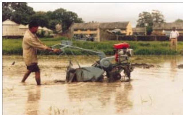
CIAE light weight power tiller in puddling operation

CIAE light weight power tiller: The light weight power tiller is provided with petrol-start-kerosene-run engine of 3.75 kW. It was evaluated for puddling operation. Puddling operation was performed with the standing water of 60 mm depth in the field. The average bulk density of soil before and after puddling operation was 0.91 and 0.66 g/cc. The weed intensity before puddling operation was 45 g/m 2 (dry weight basis) with average height of 417.5 mm. No weeds were found after two operations of power tiller. The power tiller was operated at the forward speed of 2.42 km/hr. The effective field capacity was 0.096 and 0.11 ha/hr during first and second operations. Thus total time required to