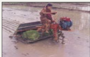
Mechanized transplanting of rice

33.3% of irrigation water compared to conventional sown (grain yield, t/h = 4.46, benefit : cost ratio = 2.63 and water requirement, mm/ha = 600). Mechanized harvesting by combine harvester was cost effective for 35.7% over reaper thresher combination (cost of harvesting and threshing, Rs/ha = 2,311) and 67% over manual harvesting and threshing (Rs/ha = 4,500), besides ensuring