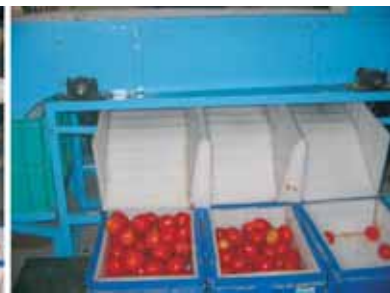
Expanding belt type fruit grader

way that the spacing between moving belts diverges from the feed end to delivery end, enabling the small fruits to fall down in appropriate collection tray placed below the moving belts. The top of belts has been dressed to form semi-circular cross section so that smaller fruits do not stay on the top of V-belt. The semi-circular top of the belt also prevents injury to the fruits. Idlers are provided to adjust tension of the belts. Commercial plastic containers are used for feeding hopper and collection trays to improve the quality of machine and to prevent damage to the fruits during the operation.