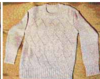
Machine knit sweaters

produced from spun-wrapped yarn is comparable with thermal insulation value of sweaters made from 100% acrylic and 100% wool.