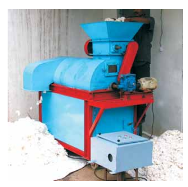
CIRCOT axial flow cotton pre-cleaner

the capacity to clean 7–10 quintals of seed cotton/hr. For controlled feeding of seed cotton, a feeder assembly is also incorporated. The pre-cleaner is capable of removing effectively trash particles like leaves, bracts, kawdi , etc. and bring about significant improvement in the colour grade of cotton without any adverse impact on the fibre quality attributes. The cleaning efficiency of the machine was noted to be 25–30% and found to reduce the trash content in seed cotton by up to 1.5%.