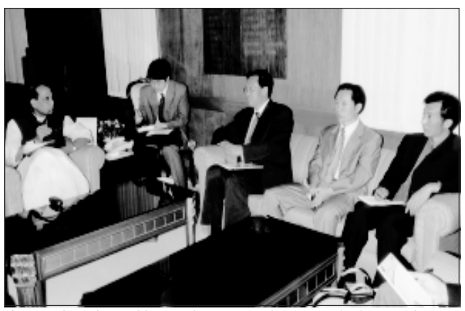
Shri Rajnath Singh, Hon'ble Agriculture Minister discussing with Chinese Delegation in New Delhi

Minister, Minister of State for Agriculture, DG, ICAR, DDGs and Directors of various institutes.