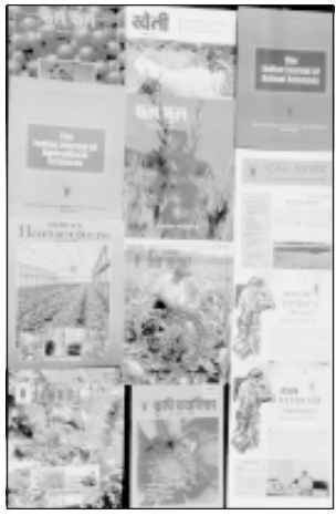
ICAR publications brought out by the Directorate of Information and Publications of Agriculture both in English and Hindi

Horticulture (quarterly). In addition, three quarterly newsletters viz. ICAR News, ICAR Reporter and ARIS News are also brought out regularly.