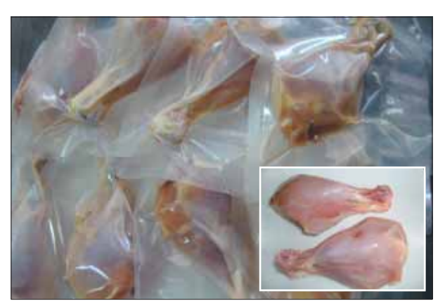
Vacuum packaged super chilled chicken drumsticks drumsticks, which can extend the shelf-life up to 30 days without freezing. This technology reduces the cost

Meat storage: Fresh meat can be stored in refrigerator for 3-5 days and up to 4 months at -20°C. Technology was developed for storing meat under super-chilling (1°C) condition and vacuum packaging for chicken