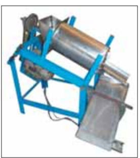
Custard-apple pulp scooping machine