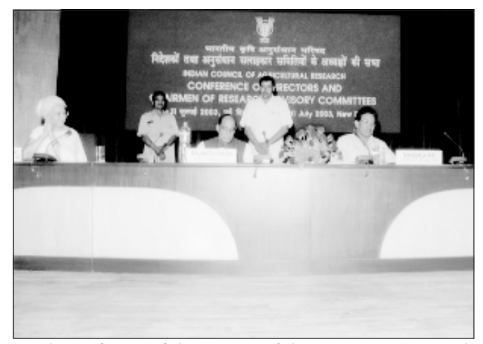
A 3-day conference of the Directors of the ICAR Institutes/Research Centres/Project Directorates and Chairmen of Research Advisory Committees, held during 29–31 July 2003