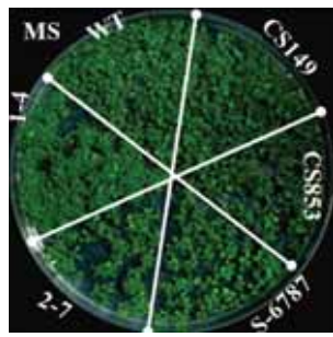
Arabidopsis seedlings grown on MS media

A high- throughput non-destructive method based on the near infra-red (NIR) and shortwave infra-red (IR) hyperspectral signatures has been developed for quantifying relative water content (a criterion of moisture-stress tolerance) of rice-plant in laboratory and pot-culture. Twenty candidate genes related to moisture-stress tolerance from rice have been cloned, and 33 different plant transformation vectors have been constructed. Two rice genes, OsFBX257 (F-box protein) and OsHOX22 (homeodomain protein), when expressed