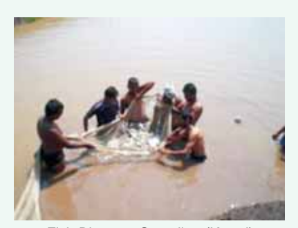
Fish Biomass Sampling (Karad)

Under the NAIP sub-project "A value chain on fish production in fragile agriculture and unutilized aquatic resources in Maharashtra", utilization of salt affected lands in western Maharashtra was taken up for carp seed rearing operations. The CIFE, Mumbai, developed demonstration units in the society-owned lands at the villages of Shere, Gondi and Malkhed, (Karad, Satara district, Maharashtra). Under the scheme, 0.25 million carp seeds were successfully raised and marketed. About 0.2 million fingerlings were raised to yearlings. Three ponds of 0.4 ha were stocked with carp fingerlings which were grown up to 250-300 g in 3 months. These results clearly showed the potential of utilization of salt-affected lands for aquaculture.