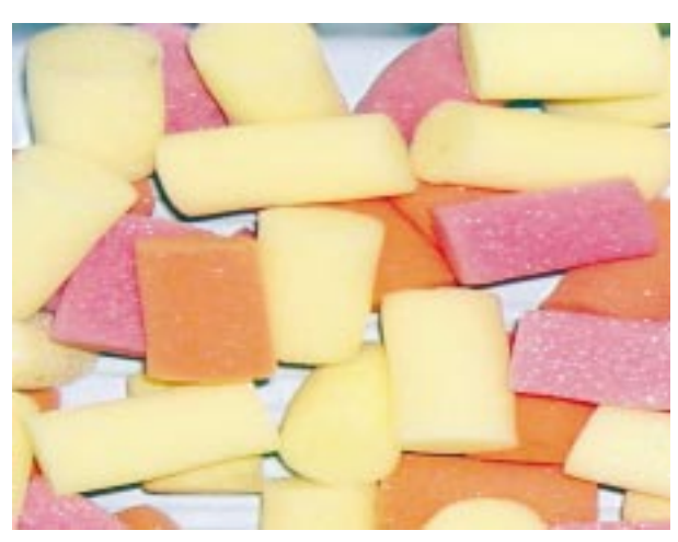
Cylindrical sponges showed maximum retention

Hypo osmotic swelling test (HOST): Sperms were evaluated for strongly coiled, weakly coiled and non-coiled under oil immersion lens. The best swelling in terms of strong coiling and total coiling was in 75-mosmol hypo- osmotic solution. There was significant difference in swelling in different