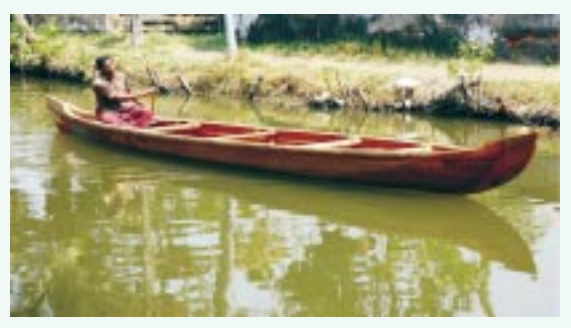
Canoe structured of coconut wood

The strength properties of coconut wood compare well with those of other structural timbers like teak and jungle jack, and studies showed that wood with a density of more than 600 kg/m³ can be used for boat building. A plank built type of canoe (length 6.4 m, breadth 0.83 m and depth 0.42 m) for gillnetting in backwaters was constructed out of coconut wood of more than 50 years old. The price of coconut wood is less than half of the conventional boat building timber, viz. aini (Artocarpus hirsuta).