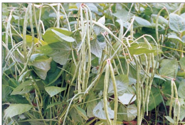
Cowpea Kashi Gauri