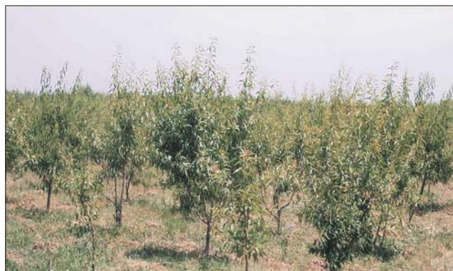
Medium high-density plantation in almond

For tissue culture plant, a three step hardening process involving primary in acclimatization hood made of plastic tray covered with polycarbonate sheet with ventilation devices, subsequent transfer to evaporative cool chamber and thereafter,