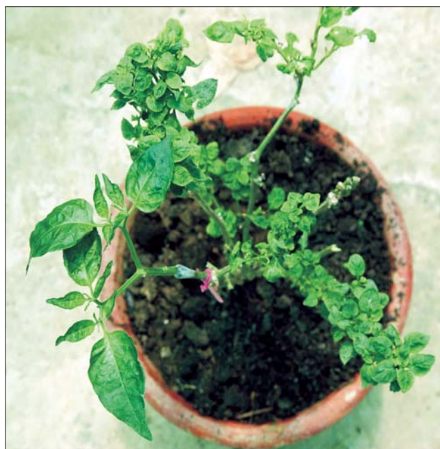
Symptomless GKC 29 scion grafted on susceptible Pusa Jwala

coated with anti cry 1 Ac antibodies. Insect bioassay was also done using neonate larvae ( Leucinodes orbonalis ) brinjal shoot-and fruit-borer with PCR and southern blot analysis confirmed transformants. Segregation analysis was done with only PCR and Southern positive plants and most of plant showed 3 : 1 ratio.