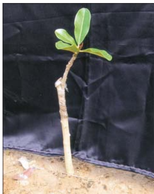
Veneer grafting in khirnee ( Manilkara hexandra )

dose of nitrogen and phosphorus during February–June, 20, 50 and 40% of recommended dose of nitrogen, phosphorus and potash during July–September and remaining 10% of N and P and 60% of potash during October–December may be applied through micro-irrigation (drip and micro-sprinkler) for optimum productivity with maximum water and nutrient-use efficiency.