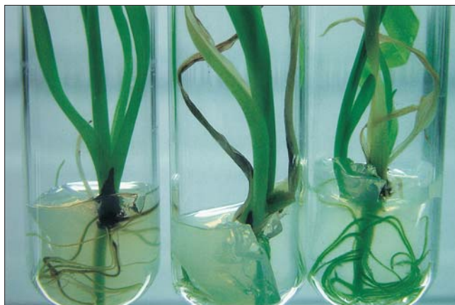
In vitro fasciculated root formation in safed musli

At Solan, maximum fresh aerial biomass of 5.38, 9.68, 24.44, 65.42 and 98.64 g/plant was recorded when planted at ridges as compared to furrows, level beds and sloppy terrace at 6, 9, 12, 15 and 18 months respectively. Similarly, transplanting on 16 August recorded maximum fresh aerial biomass of 6.63, 12.86, 31.61, 65.73 and 108.91 g/plant compared to transplanting on 31 August and 15 September.