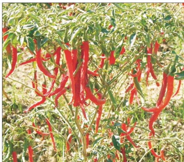
Chilli Kashi Vishwanath