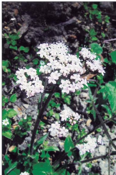
Inflorescence in valerian