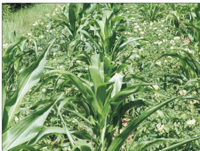
Potato–maize intercropping at Shimla