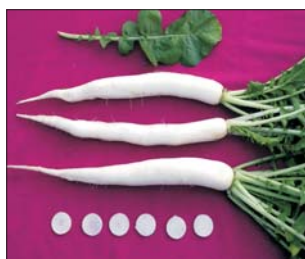
Radish Kashi Hans