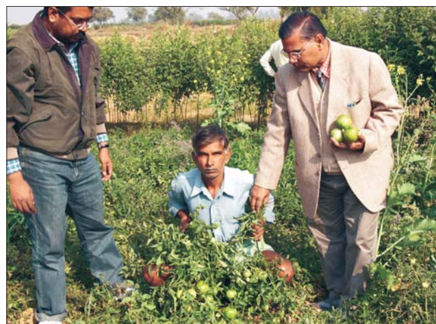
Performance of Kashi Vishesh at farmers' fields