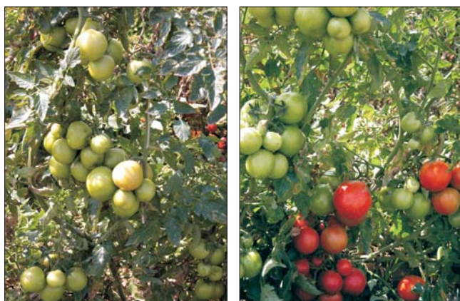
Staked tomato grown under IPNM

Antioxidant activity (AOA) in tomato: A technique has been standardized for estimation of antioxidant activity in tomato fruits to assess variability. Total antioxidant activity of sample extracts was analyzed using 2, 2-diphenyl-1-picryl-hydrazyl (DPPH) by recording absorbance at 515 nm. The standard curve was prepared for the reaction of TROLOX with DPPH and data was converted to activity in terms of \mu moles trolox equivalents/100 g sample. Significant differences ( p > 0.05 ) were recorded for antioxidant activity among 15 cultivars which ranged from 2.19 to 5.79 \mu moles trolox equivalents/g with an overall mean for all the entries of 3.854 \mu moles trolox equivalents/g.