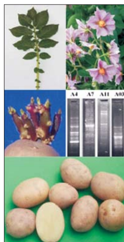
→ Leaf, flower, sprout, DNA fingerprints and tubers of MP/97-644 a promising hybrid for hills

At Patna, rice equivalent yield and economic returns were highest in potato–onion–rice followed by potato–maize–rice crop sequence,