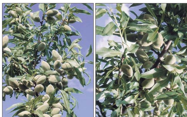
Almond bearing in medium high-density plantation