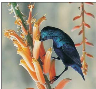
Sunbird ( Nectarinia asiatica var. asiatica ) mediated pollen transfer in Aloe barbadensis

Downy disease is a major constraint in cultivation of isabgol. The downy mildew infection on bio-constituents of host leaf