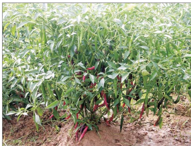
Chilli Kashi Anmol

Transformation: Brinjal genotypes Punjab, Sadabahar, Pant Rituraj, VR Baigan 1 (IVBR 1), VR Baigan 3 (IVBR 3), VR Baigan 9 (IVBL 9) and VR Baigan 14 (BRSPS 14), were used for regeneration and transformation. Transformation was performed using Agrobacterium tumefaciens in VR Baigan 9 (IVBL 9) using Cry 1Ac gene from T-DNA of binary vector plasmid pBinAR. More than 80 putative transgenic plants were regenerated. The gene integration was detected by PCR analysis. The amplification of 0.7 kb band for npt II and 0.9 kb for Cry 1Ac shows the presence of inserted gene. The transformants were further analyzed by southern blot hybridization. Southern analysis revealed 1 kb band with single blot hybridization in most of the transformants. The presence of Cry 1Ac toxin protein in plant was confirmed strip