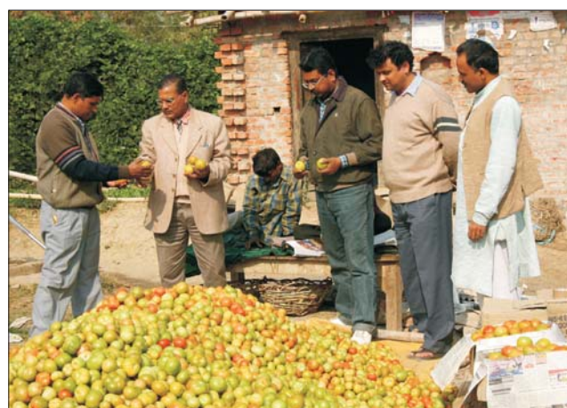
Yield of tomato Kashi Vishesh at farmers' fields

Tomato Kashi Amrit, Kashi Anupam and Kashi Vishesh developed by IIVR Varanasi, were demonstrated at farmers' fields of Varanasi, Chandauli, Sonebhadra and Mirzapur districts in Uttar Pradesh. On an average, all varieties gave 520.83 q/ha compared to 365.25 q/ha (control). All these varieties are spreading at