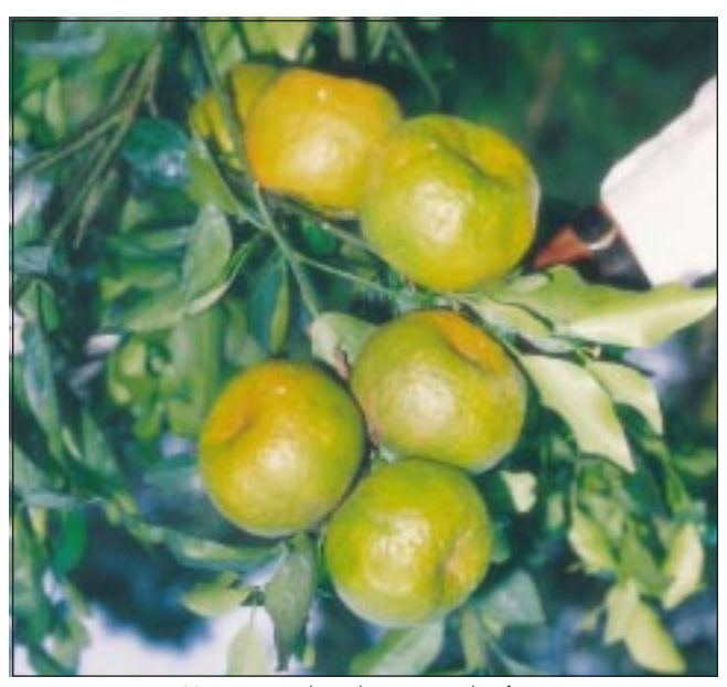
Nagpur mandarin bearing quality fruits

Two hybrids of rough lemon Troyer citrange were promising rootstocks for resistance to Phytophthora . For determining quantum of water stress in Nagpur mandarin, leaf water potential of -3.5 MPa was found effective for inducing flowering. Paclobutrazol @ 18g/plant was found effective in inducing flowering in problematic high clay soils. Chlormequat chloroide (CCC) (2000 ppm) or stem girdling (0.3 - 0.5 cm) applied in September induced hasta flowering in October.