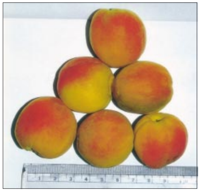
The fruits of Apricot Suka have red cheeks

Apricot selection, Suka, has been made from Ladakh region, which has very attractive appearance due to red cheeks. This selection has 22 g fruit weight, 3.61 cm length, 3.64 cm diameter and 31.26° Brix. The average pulp weight is 20 g and pulp stone : ratio being 10. Its kernels are also sweet.