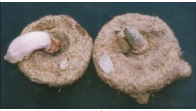
A promising hybrid of elephant-foot yam

The application of two-thirds of recommended dose of N along with 10 kg/ha Azospirillum as soil application alone or in combination with 2 kg/ha Azospirillum as vine dipping gave highest marketable tuber yield and dry