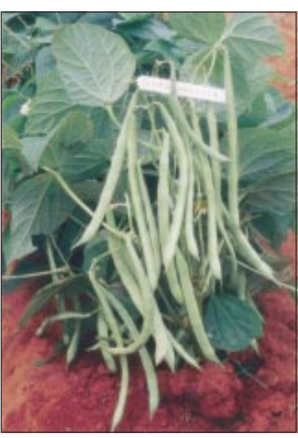
Arka Anoop provides 18–21 tonnes/ha quality pods

Two advanced progenies of bottle gourd (AHLS Round