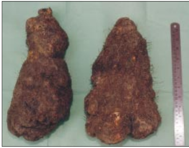
Pre-released accession of greater yam

Two triploid cassava clones 4-2 (3x) and 5-3 (3x) having higher extractable starch (>27%) were identified for industrial use. In sweet potato, 3 high carotene