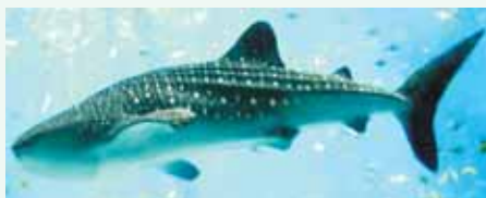
Endangered whale shark ( Rhincodon typus )

Whale shark ( Rhincodon typus ) is an endangered species protected under schedule 1 of the Indian Wild life Protection Act 1972 and was designated as endangered species under "Convention on International Trade" in April 2001. Forensic investigations using DNA barcoding resulted in the identification of whale shark meat and hence, revealing the illegal trading of this species. Thus, DNA barcoding provides scientific evidence which can be used effectively in curtailing illegal trade of endangered organisms and the technique will go a long way in preserving biodiversity.