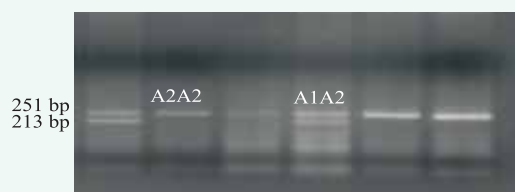
PCR-RFLP of \beta -Casein (CASB) Taq I showing A2A2 and A1A2 genotypes

Animals (618) of 15 Indian zebu cattle breeds from different agro-climatic regions of India along with 231 buffaloes of 8 river buffalo breeds were genotyped in beta-casein (CSN2) locus by PCR-RFLP method. The \beta -casein A1/A2 frequency data indicated predominance of A2 variant (0.987) in zebu cattle breeds while buffaloes indicated only A2 milk type.