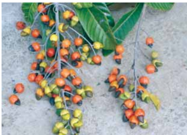
Fruit of wild cashew ( jungly caju )

Mushroom: About 217 specimens of different wild mushrooms were collected. Out of them, 192 were identified up to genus level. Studies on germplasm characterization revealed wide interspecific variation among 41 strains of Pleurotus species.