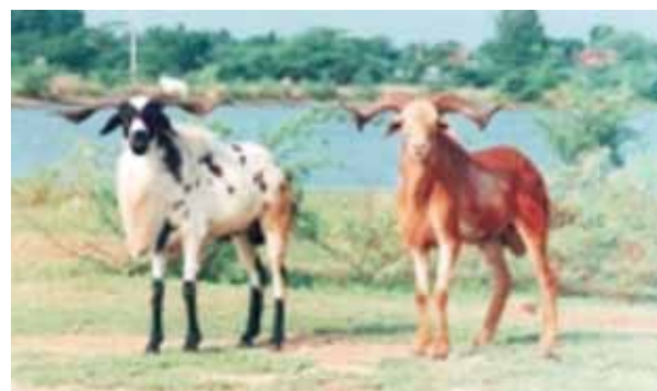
Rams of Vembur sheep

Vembur sheep: Vembur sheep also known as Pulli Adu, is found in Virudhunagar, Tirunulveli and Thuthukudi districts of Tamil Nadu. Vembur