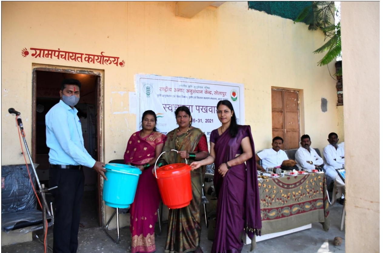
Distribution of dustbin to the Head of the village (Surpanch) at Telangwadi