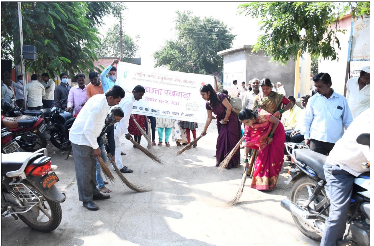
Cleaning of the premises area of the grampanchayat at Telangwadi