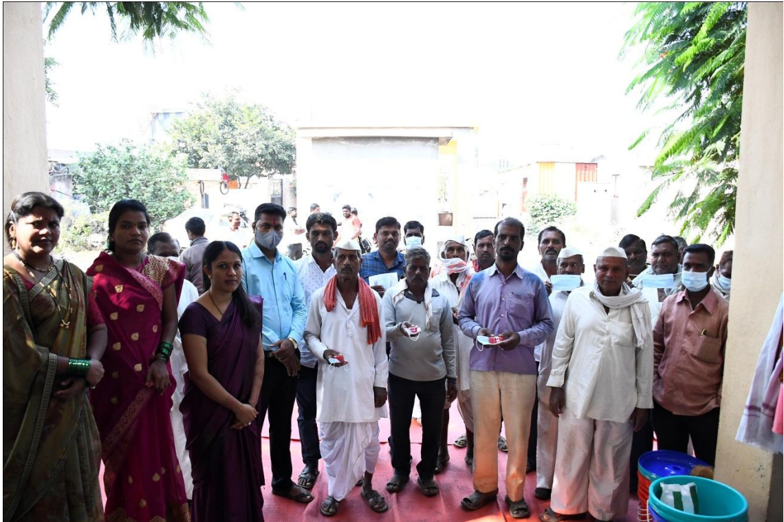
Distribution of soap, mask and dustbin to the farmers at Telangwadi