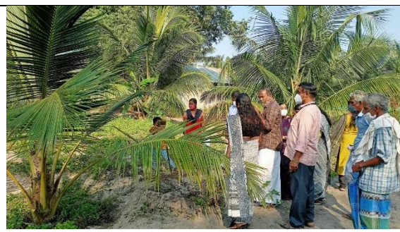
Interaction of scientists with farmers on organic farming at MGMG village