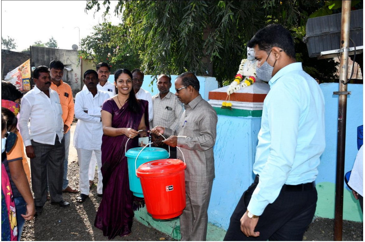
Distribution of dustbin to the principal of the school at Telangwadi