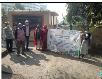
Regional Centre, ICAR-NBSS&LUP, Kolkata