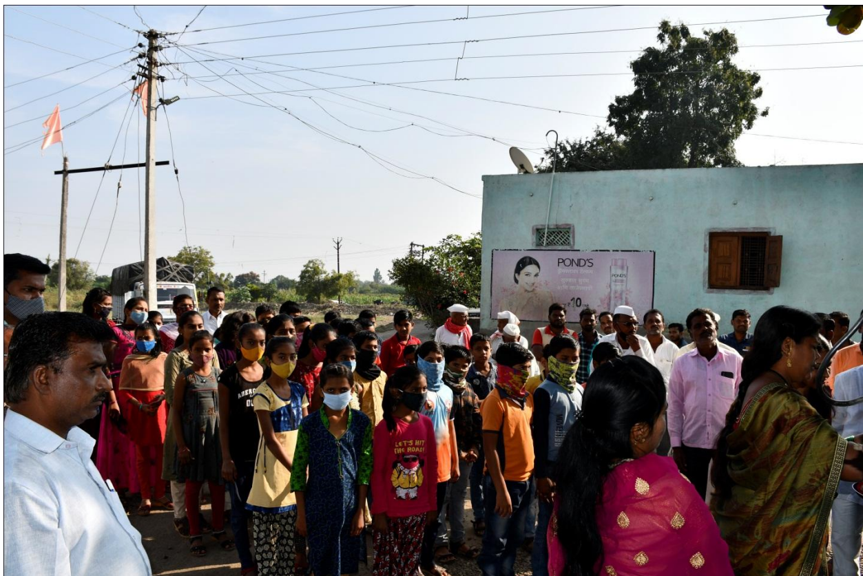
School children involved in the swachhata campaign