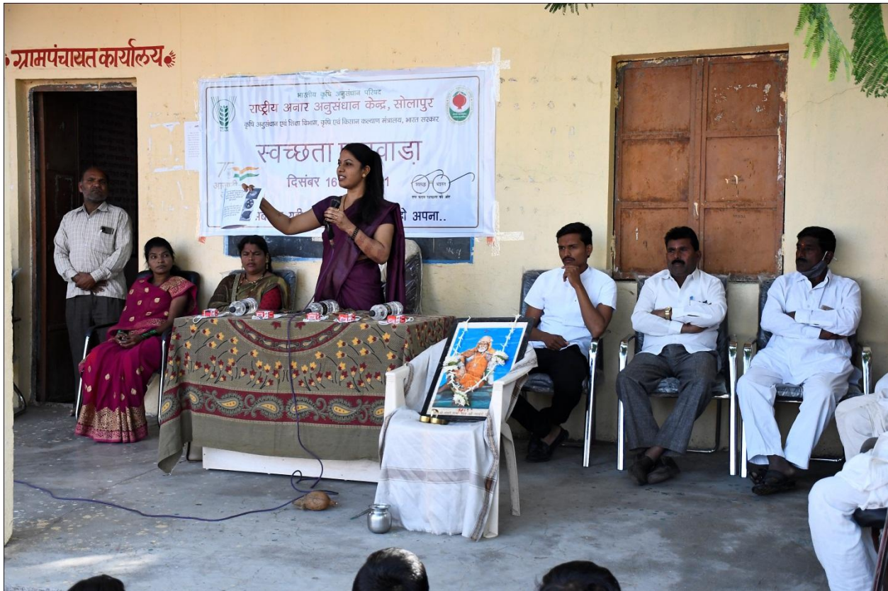
Awareness about the cleanliness, hygiene and sanitation