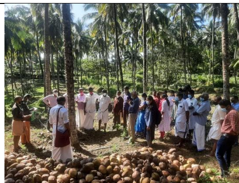
Interaction of scientists with farmers on Organic farming at Bedagam village (MGMG village)