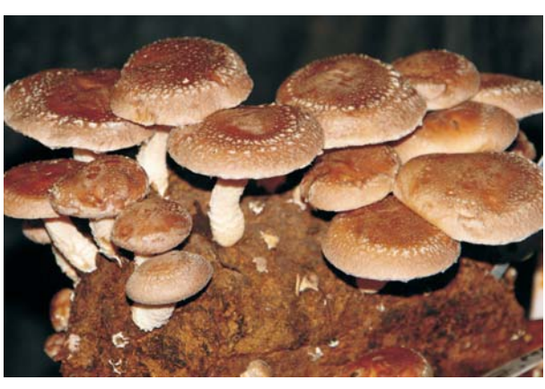
Shiitake mushrooms grown on wheat bran

Mushroom: Of the 53 hybrid strains of Pleurotus sajor-caju evaluated on wheat straw, 10 gave more than 68–85% BE. In paddy straw, mushroom 42 single spore isolates were compared for their growth rate, type of mycelial thread,