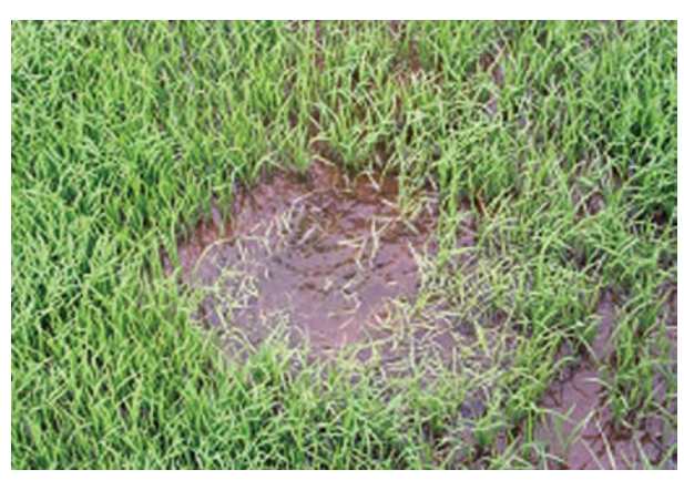
Rodents damaged nursery

In Andhra Pradesh, damage to kharif rice was recorded from 12.4 to 72.9% and up to 40% to rabi rice, and tiller damage was 11.09% and 13.6% in sali and boro rices. Pineapple suffered maximum with 13.2% fruit damage in lower Brahmaputra