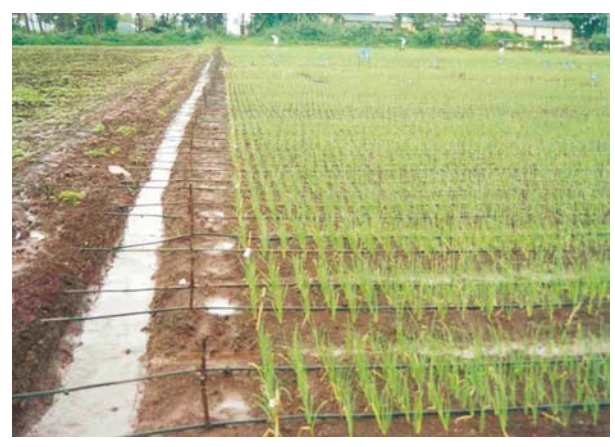
Sprinkler irrigation in onion increases yield (15–20%) and saves water (40–50%)

In broccoli, maximum head yield (366.0 q/ha) was recorded by application of poultry manure @ 5 tonnes/ha + half NPK (60:30:30 kg/ha). In organic farming trials of okra, maximum yield was recorded by application of FYM @ 10 tonnes/ha + poultry manure @ 2.5 tonnes/ha. The highest water-use efficiency and water saving were obtained under 75% PE with drip irrigation scheduling at alternate day in cucumber. In water stress study of tomato, the flowering stage is the most critical stage for moisture stress followed by active vegetative stage.