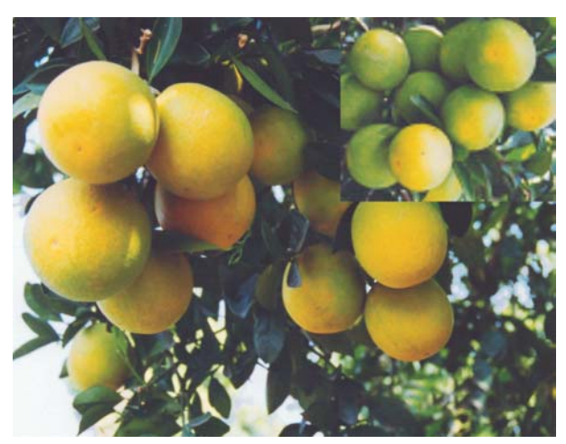
Sweet orange yields better in site-specific treatment

Citrus: Site-specific nutrient management (800 g N, 400 g P, 600 g K, 250 g each of FeSO<sub>4</sub>, MnSO<sub>4</sub> and ZnSO<sub>4</sub>/tree) in 'Mosambi' sweet orange (Citrus sinensis) helped improve fruit yield (14.7 tonnes/ha) over conventional farmers' practices (10.6 tonnes/ha) and application of recommended doses of fertilizers (11.6 tonnes/ha).