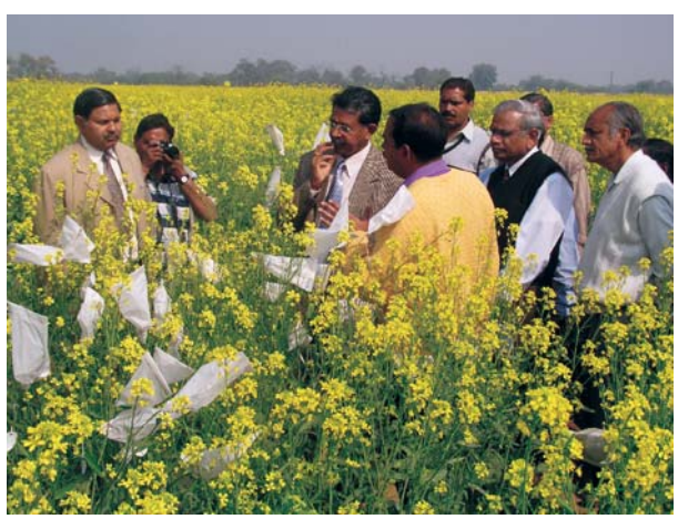
Experimental mustard hybrid evaluation block at the NRCRM

Rapeseed-mustard: Toria sowing at dough stage of rice has been remunerative in rice- toria sequence, and has been recommended for central Brahmaputra valley zone of Asom. In north Gujarat, basal application of 20 kg S/ha in kharif guar —mustard and 40 kg S/ha in kharif mungbean/pearl millet—mustard sequence have been recommended.