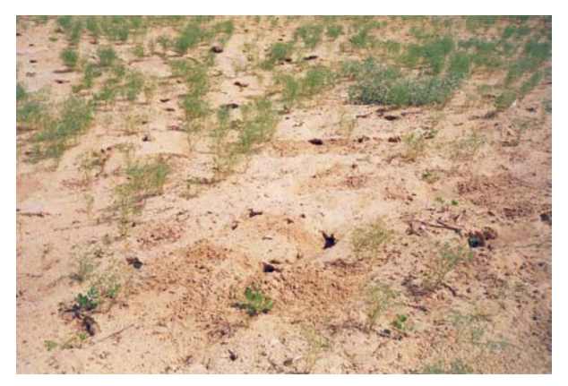
Rodents damage cumin crop

region. And cumin, an important seed-spice crop in Rajasthan suffered damage at vegetative growth stage, due to gerbils, Tatera indica and Mus hurrianae.