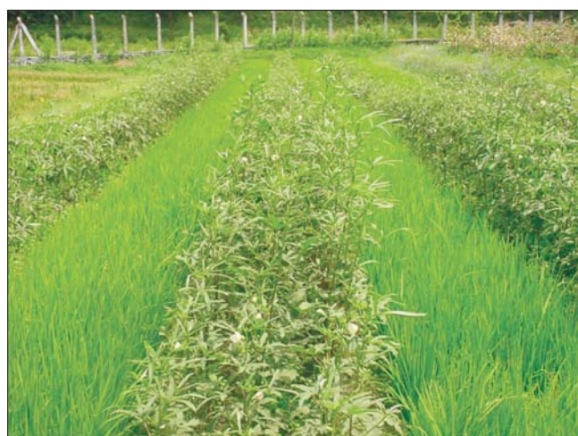
Rice in sunken and okra in raised bed

Through research on utilization of marshy land, raised and sunken bed technology at the ratio of 1:4 ratio was found suitable for both rice- and maize-based cropping systems, giving rice and maize-equivalent yield of 35.94 tonnes/ha and 13.48 tonnes/ha respectively.