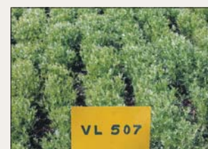
VL Masoor 507, shows high degree of resistance to wilt

cross hybrid developed in the country through marker assisted selection. It is the quality protein maize version of the Vivek Maize Hybrid 9. It possesses 40.7% higher tryptophan than Vivek Maize Hybrid 9. This quality protein maize hybrid was identified for release in zone-I (average yield: 6,118 kg/ha) and zone-IV (average yield: 3,531 kg/ha).