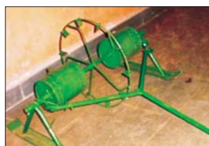
A 4-row pre-germinated paddy seeder

A seed drill was developed for high slope condition. The drill can be operated by two persons and is suitable for sowing of maize, pulses and some oilseeds crops. A 4-row pre-germinated paddy