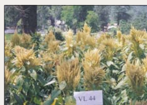
Amaranth variety VL Chua 44 possesses tolerance to viral disease mosaic