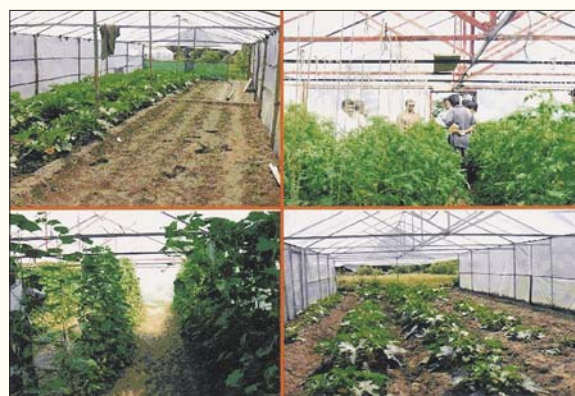
Protected cultivation under polyhouses at Bhagartola village

Development of water resource by harvesting surface runoff and perennial hill streams in LDPE lined poly-tanks and protected cultivation of off-season vegetables utilizing the harvested water have helped in transforming the hill economy of Bhagartola village, located around 60 km away from District HQ Almora (Uttarakhand State). In this village, 20 low-cost poly-tanks and 22 low-cost poly-houses were