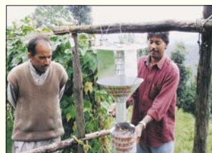
Light trap at farmer's field

White grubs are the cosmopolitan insect pests of agriculture, forest and pasture lands. The pest causes severe economic loss in upland paddy, finger millet, barnyard millet, maize, potato and many other vegetables, fruits and fodder crops in the hills of north-western Himalayan region, where nearly 40 species of this phytophagous pest were recorded. The beetles emerge from soil from May to October. To combat the problem, VPKAS, Almora, designed a user-friendly low cost (Rs 570), light trap for efficient mass trapping of beetles, to reduce the population of white grubs in soil. Deployment of 61 light traps in different villages of Almora district on community basis led to trapping of beetles 114,000 in