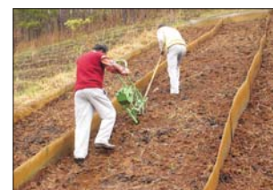
Operation of manual seed drill for hill slope

seeder for wetland paddy in valley and terraces was developed and demonstrated.