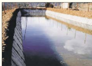
LDPE-lined tank (280 m 3 size) constructed at Darim village for micro-irrigation system

Lack of efficient irrigation system is a major hindrance to increase the productivity of hill agriculture. The lift irrigation system demands high investment in the hills, where lift varies between 40 and 80 m. This high cost makes the agriculture in the hills a risky proposition. The frontier technologies like micro-irrigation system (MIS) not only helps in utilizing water efficiently (90–95%) but also minimizes the other problems associated with the flood irrigation system. Such advanced irrigation technique was explicitly installed in 0.64 ha in Darim village of Naini Tal District with farmers' contribution. The farmers' contribution was 47% of total MIS set up cost. The perennial stream (18 litres/min) passes at 1.5 km distance from