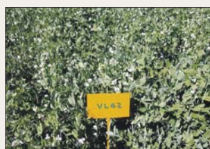
Field pea variety VL Matar 42 having good looking quality