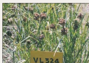
Medium-maturing variety VL Mandua 324 of finger millet