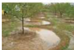
Half moon system