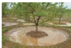
Cup and plate system