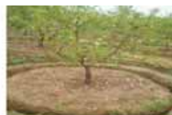
Full moon system