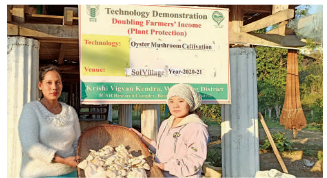
Ovster Mushroom Cultivation - Arunachal Pradesh