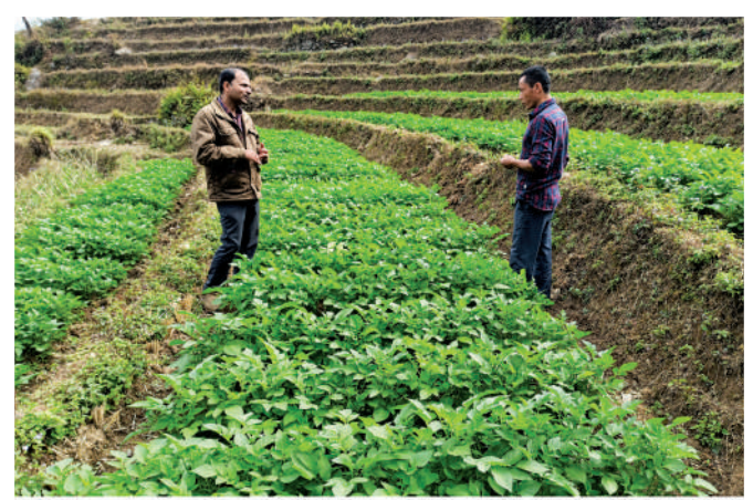
Potato Cultivation- Sikkim