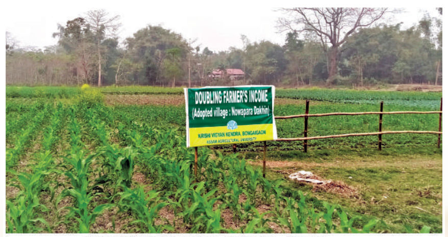
Scientific Cultivation of Maize- Assam