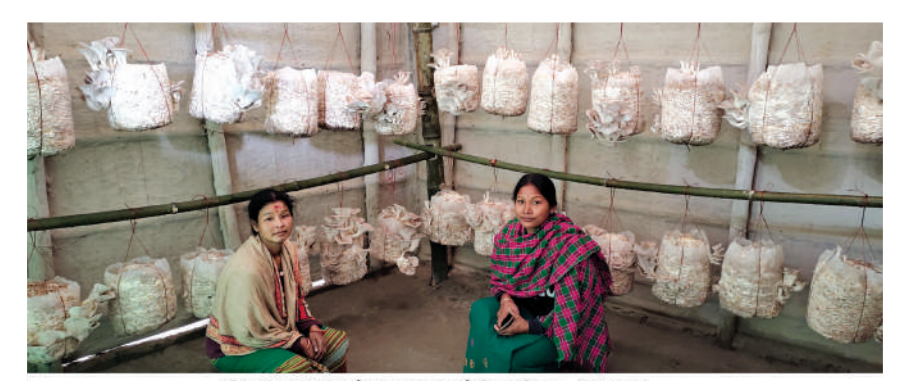
Oyster Mushroom cultivation- Assam