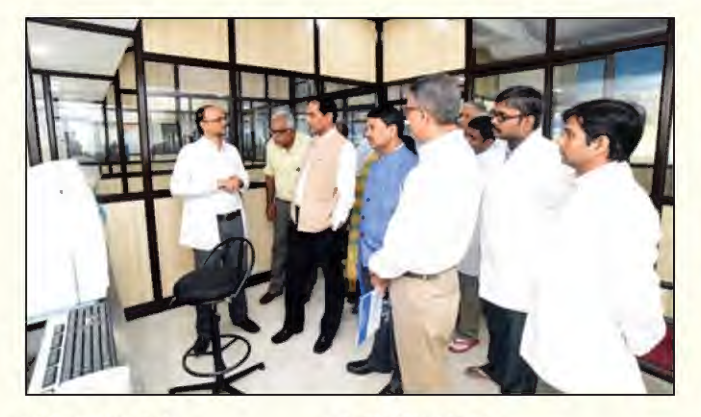
Solar Boat II developed at ICAR-CIFT.

He applauded the great work done by ICAR-CIFT and emphasized on perfection in work. He appreciated ICAR-CIFT for providing great visibility to ICAR. He called for better communication of salient achievement to stakeholders and asked for preparation of brief flyers on all available technologies.