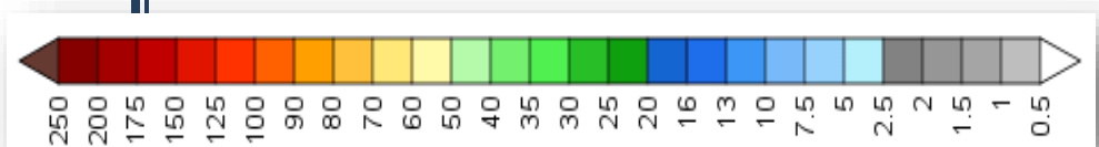
Figure: 2. Precipitation forecast for 29 October to 04 November 2018.